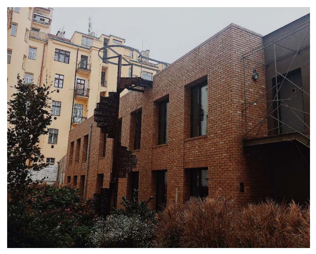
TABLO hub – NEO house in Prague at Letná Art District