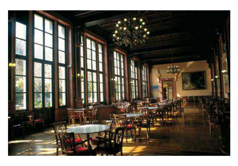
"Circulo Industrial" - Alcoi