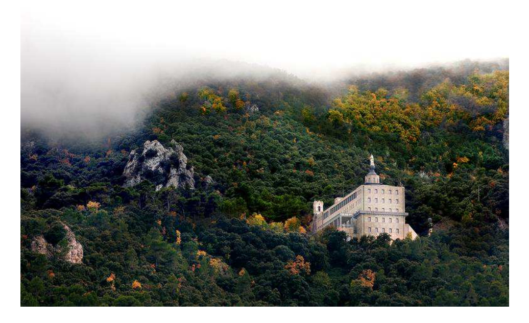
Natural Park "Font Roja"

An official UPV attendance certificate will be given to all attendees.