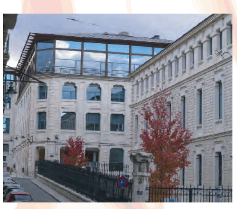
Center of Alcoy's art