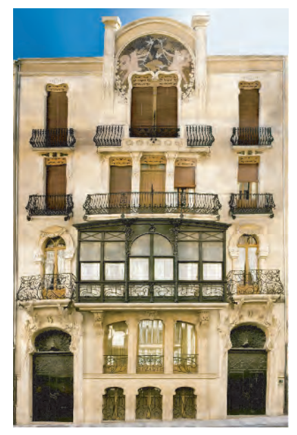
Casa del Pavo

You can also visit the famous Natural Park of Carrascal in Font Roja, an excellent representation of the Mediterranean forest, is located in the mountains of Menejador occupying up to 2,298 ha is the highest peak in the province of Alicante very rich in fauna and flora. Ideal for a natural look with fresh air and quiet surrounds. You can also visit The Natural Park of the Sierra de Mariola, the greenway of Alcoy and Sant Bonaventura Racó-Canalons.