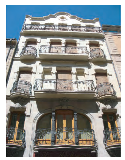
Carrer Sant Nicolau,4