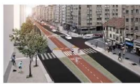
Gamonal's Boulevard Project (Burgos)