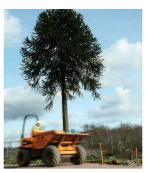
Development underway at the Monkey Puzzle Tree, Telford Millennium Community

Each Millennium Community has a different theme showcasing particular approaches to sustainable living. These include integrated transport at Hastings, life-long learning in Telford, community integration at South Lynn and information communications technology at Oakgrove, where around 2,000 homes will have broadband connections.